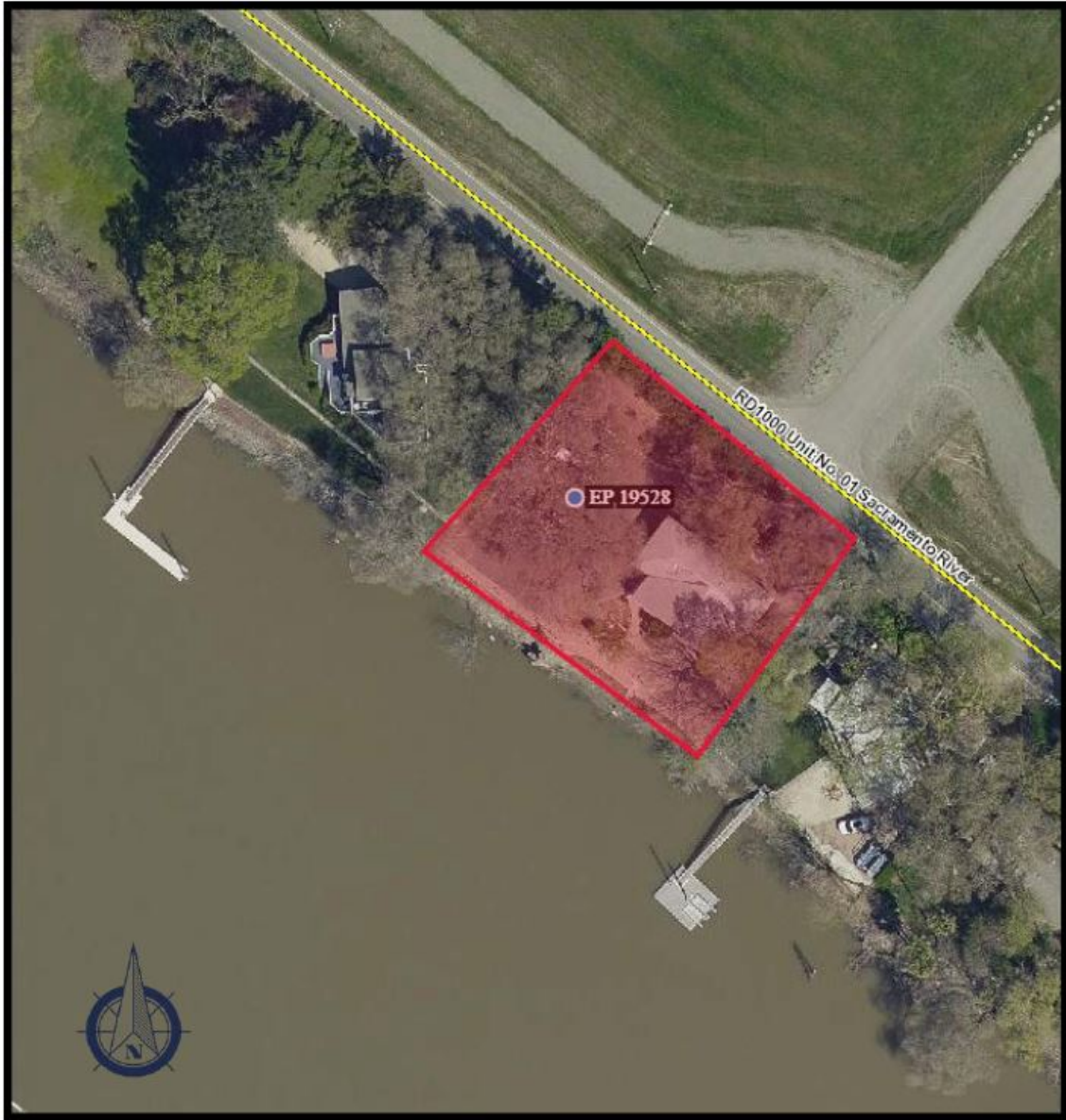
3) Proposed Footprint Map